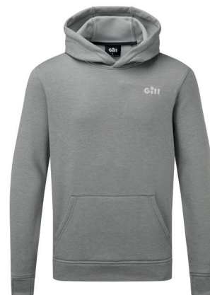
Langland Hoodie – £70 Available in adult unisex.

Made from XPLORE® 2-layer waterproof and breathable fabric to keep you dry. Wear over a single layer in the warmer months or layer up in colder weather.