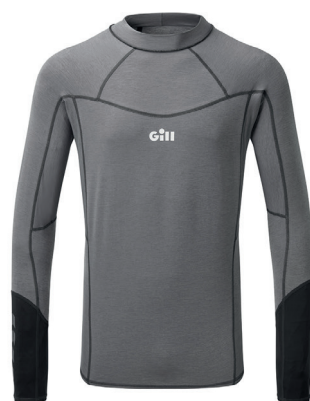
Eco Pro Rash Vest – £35 Available in Men's, Women's and Junior styles.

We've pulled together our top 5 picks that will carry you through this season and beyond.