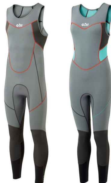
ZenLite Skiff Suit – £110 Available in Men's, Women's and Junior styles.

In the warmer months it's important to ensure you're protected from the sun, particularly if you're out all day. The Eco Pro Rash Vest is a next to skin top with built in UV50+ protection. Multifunctional by design, this water sports staple can be worn by itself or layered with other garments.