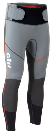
ZenLite Trousers – £88 Available in adult unisex and junior styles.

A multifunctional 2mm neoprene trouser ideal for a multitude of activities. The flat lock seams, 4-way stretch and adjustable waistband ensure a comfortable and secure fit. In the colder months wear with the Hydrophobe Thermal Trousers underneath.