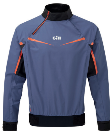
Pro Top – £98 Available in Men's and Women's styles.

A multifunctional 2mm neoprene trouser ideal for a multitude of activities. The flat lock seams, 4-way stretch and adjustable waistband ensure a comfortable and secure fit. In the colder months wear with the Hydrophobe Thermal Trousers underneath.