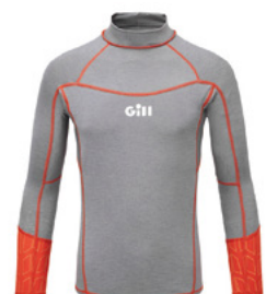
Eco Pro Rash Vests – Adult £40, Junior £25